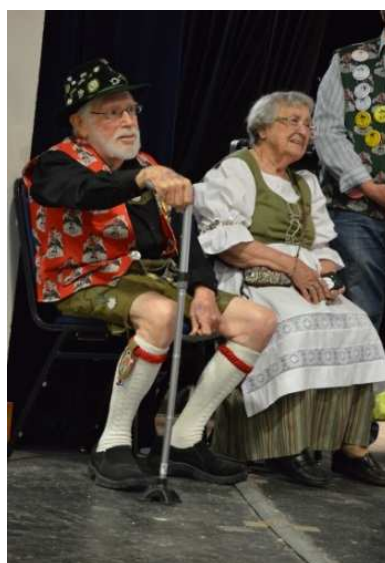
Models for Oma & Opa